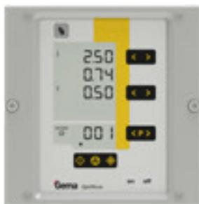
OptiMove axis control