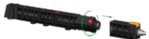
Tool-less and fastest access to all wear parts

Your global partner for high quality powder coating