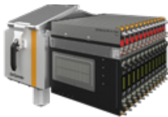
OptiSpray All-in-One integration to a OptiSpeeder (powder hopper) of an OC10

OptiSpray All-in-One and OptiSpray application pumps equip as standard the All-in-One OptiCenters (powder management center), providing flexibility and best coating results.