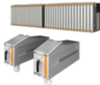
OptiSpray All-in-One integration to both OptiSpeeders of an OC11 (DualSpeeder technology)