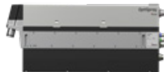
OptiSpray (AP02) application pump