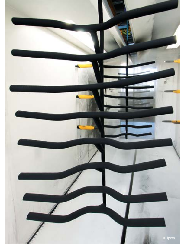
Sa.Ve.M. parts at the entrance to the coating booth.