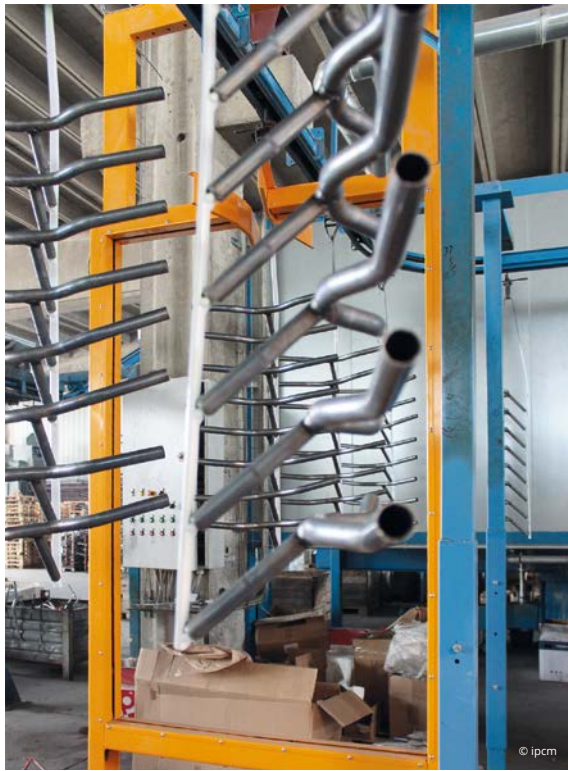
Bicycle handlebars moved from the overhead conveyor to the chemical pre-treatment tunnel.

ifferentiating its target markets can help a coating contractor to expand and grow. The key to success with this strategy is to achieve the highest quality possible for all types of products handled, regardless of their shape, size, coating specifications, and required finishes. This means that it is necessary to invest in flexible technologies that can be easily adapted to the needs of different customers and the characteristics of different parts without requiring the installation of more than one coating line.