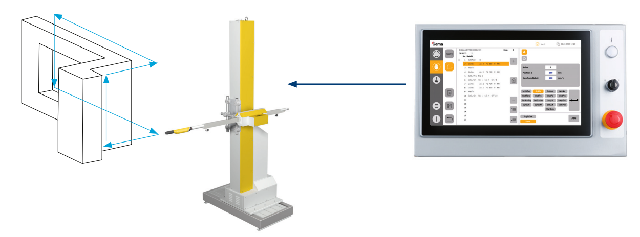
Programming sequential axes movements directly on MagicControl 4.0

The central control unit MagicControl 4.0 with the option sequence program enables individual movement sequences of individual axes or entire stations. The sequence movements of X/Y-, synchronous, infeed or rotation axes for the coating of complex components can be programmed and managed effortlessly directly on the screen. This results in exact coatings and reproducible results. Especially parts with cavities (e.g. baking cavities benefit from this option). The coating guns follow the inner contour of the baking box, this while the conveyor is running. The maximum suspension tolerance in all three directions is +/-6 mm.