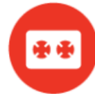
Home Appliances and Cooking Device Parts