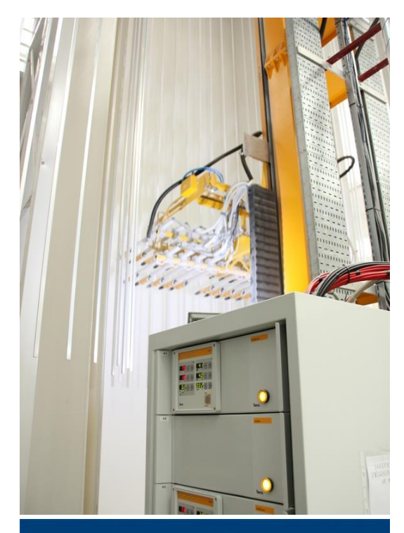
MultiTronic with 22 guns – plant capacity: 4000 kg per hour