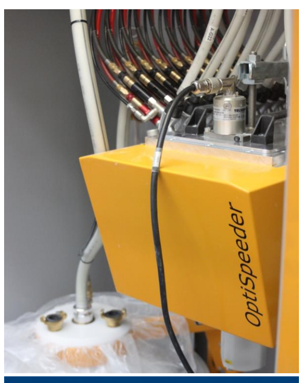
OptiCenter OC02 - Quick color change