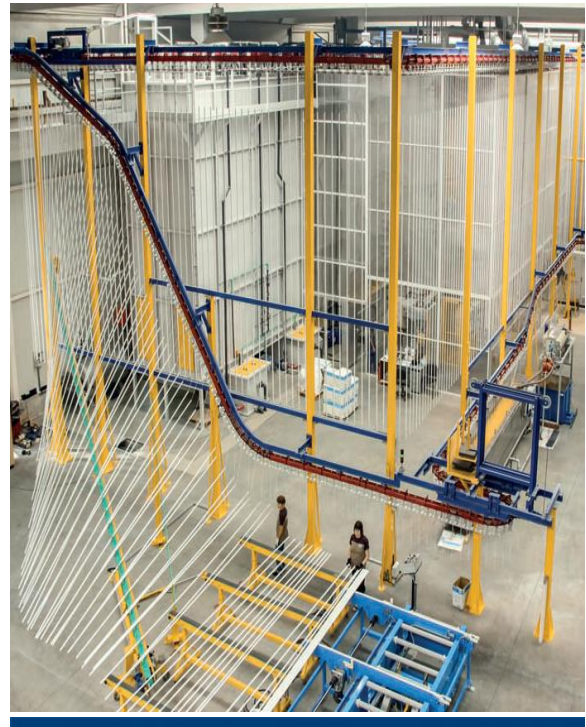
High quality, productivity and automation