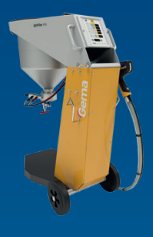
OptiFlex® Pro S