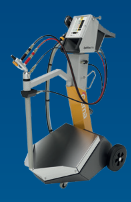
OptiFlex® Pro Q