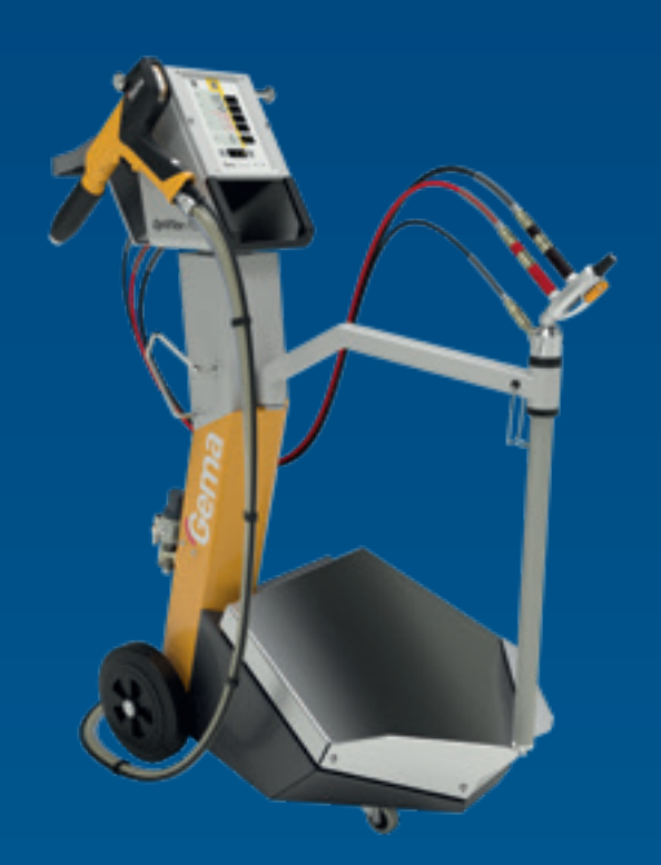
OptiFlex® Pro B