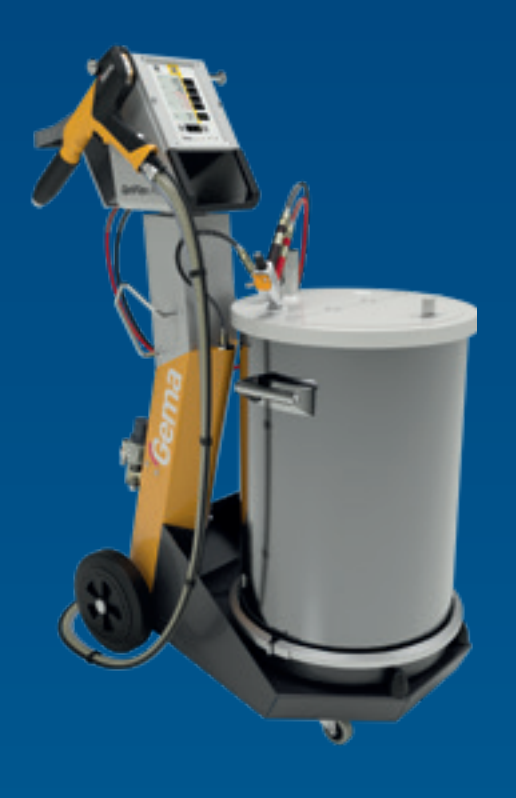
OptiFlex® Pro F