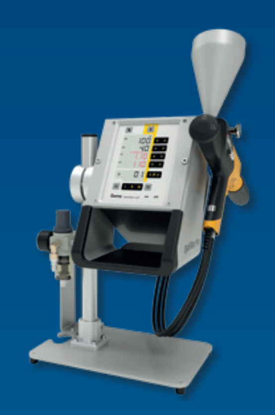
OptiFlex® Pro CF