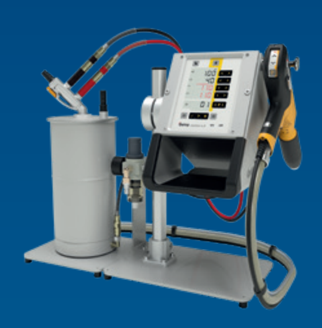
OptiFlex® Pro L